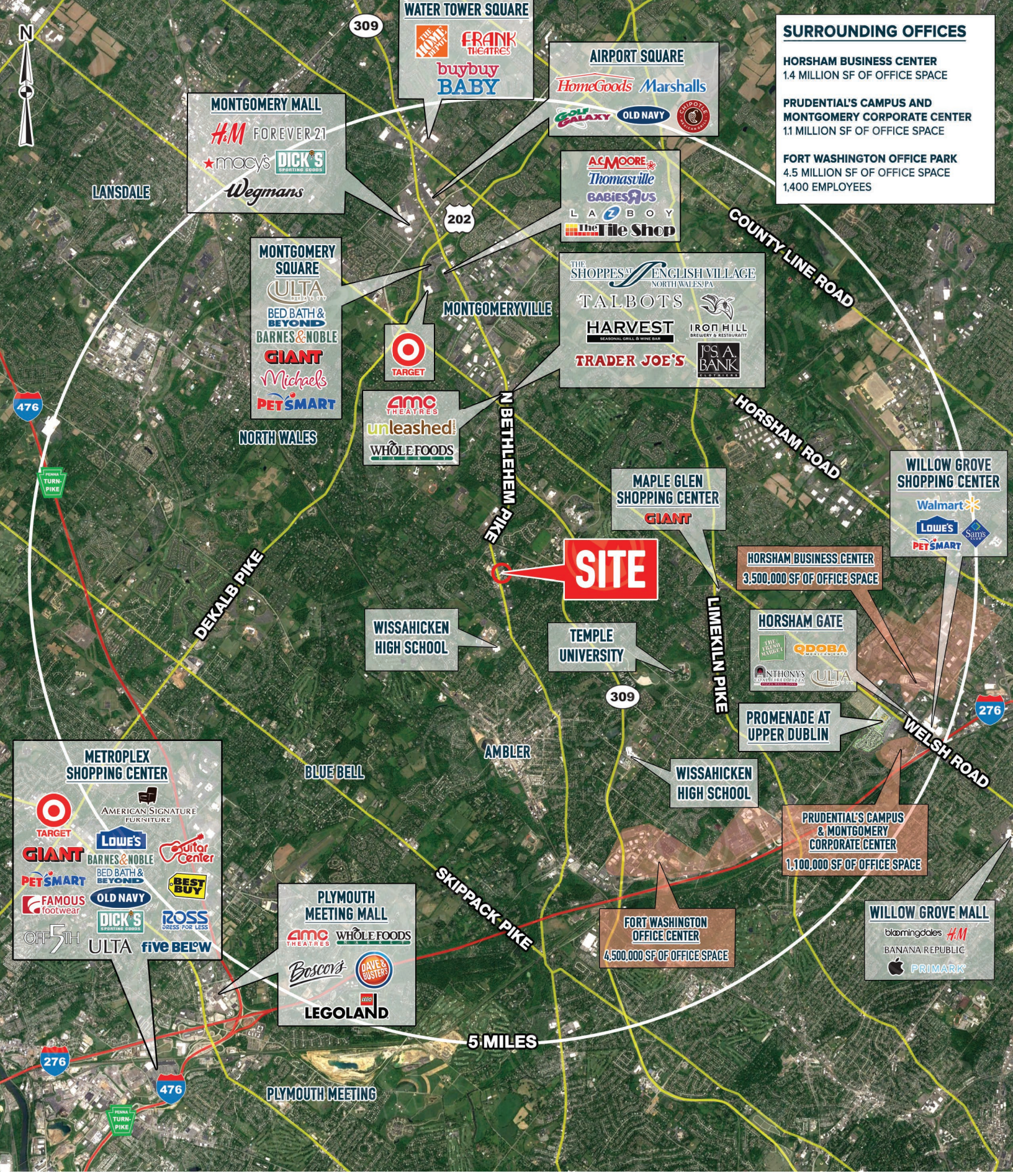
The information and images contained herein are from sources deemed reliable. However, Metro Commercial Real Estate, Inc. makes no representation whatsoever as to their accuracy or authenticity. Images shown may be modified for illustrative purposes. Images may be out-of-date and not current. 2.12.