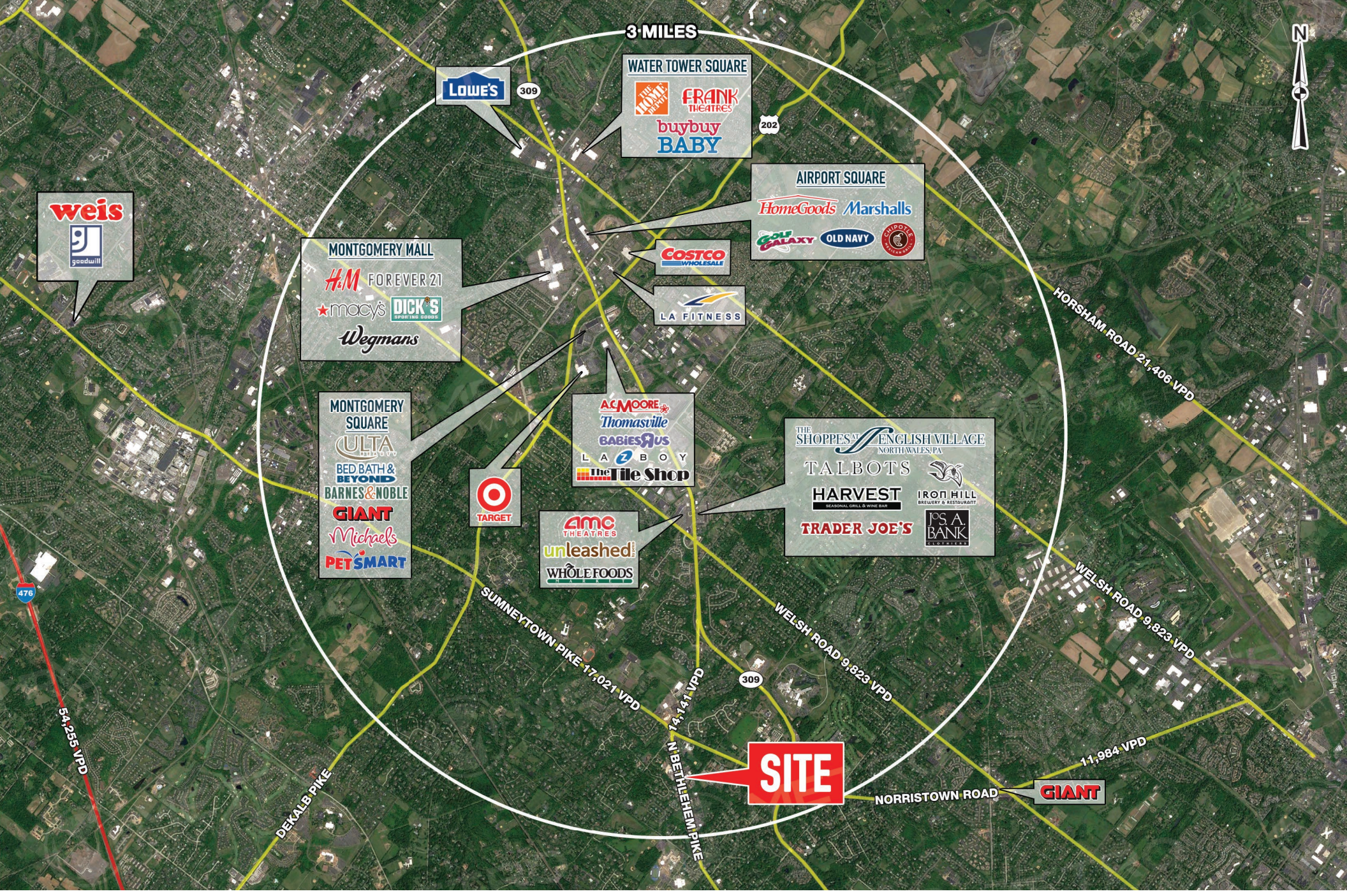
The information and images contained herein are from sources deemed reliable. However, Metro Commercial Real Estate, Inc. makes no representation whatsoever as to their accuracy or authenticity. Images shown may be modified for illustrative purposes. Images may be out-of-date and not current. 2.12: