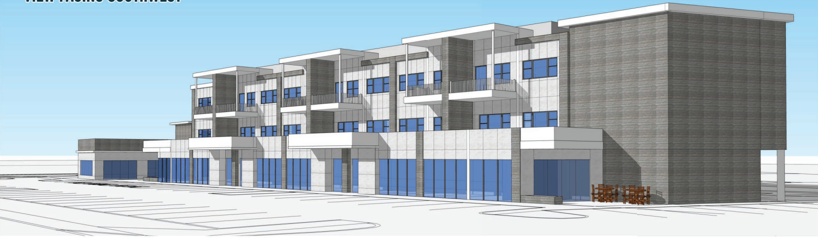
1 VIEW 2 NOT TO SCALE