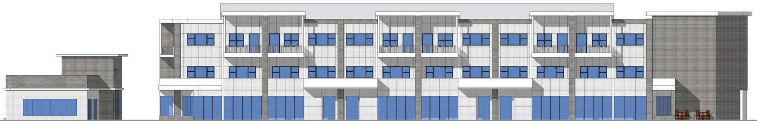
1 VIEW 1 NOT TO SCALE