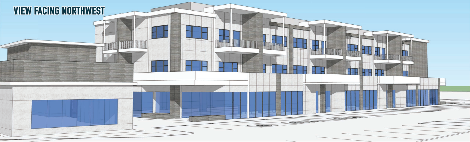
1 VIEW 3 NOT TO SCALE

The information and images contained herein are from sources deemed reliable. However, Metro Commercial Real Estate, Inc. makes no representation whatsoever as to their accuracy or authenticity. Images shown may be modified for illustrative purposes. Images may be out-of-date and not current. 5.10.18