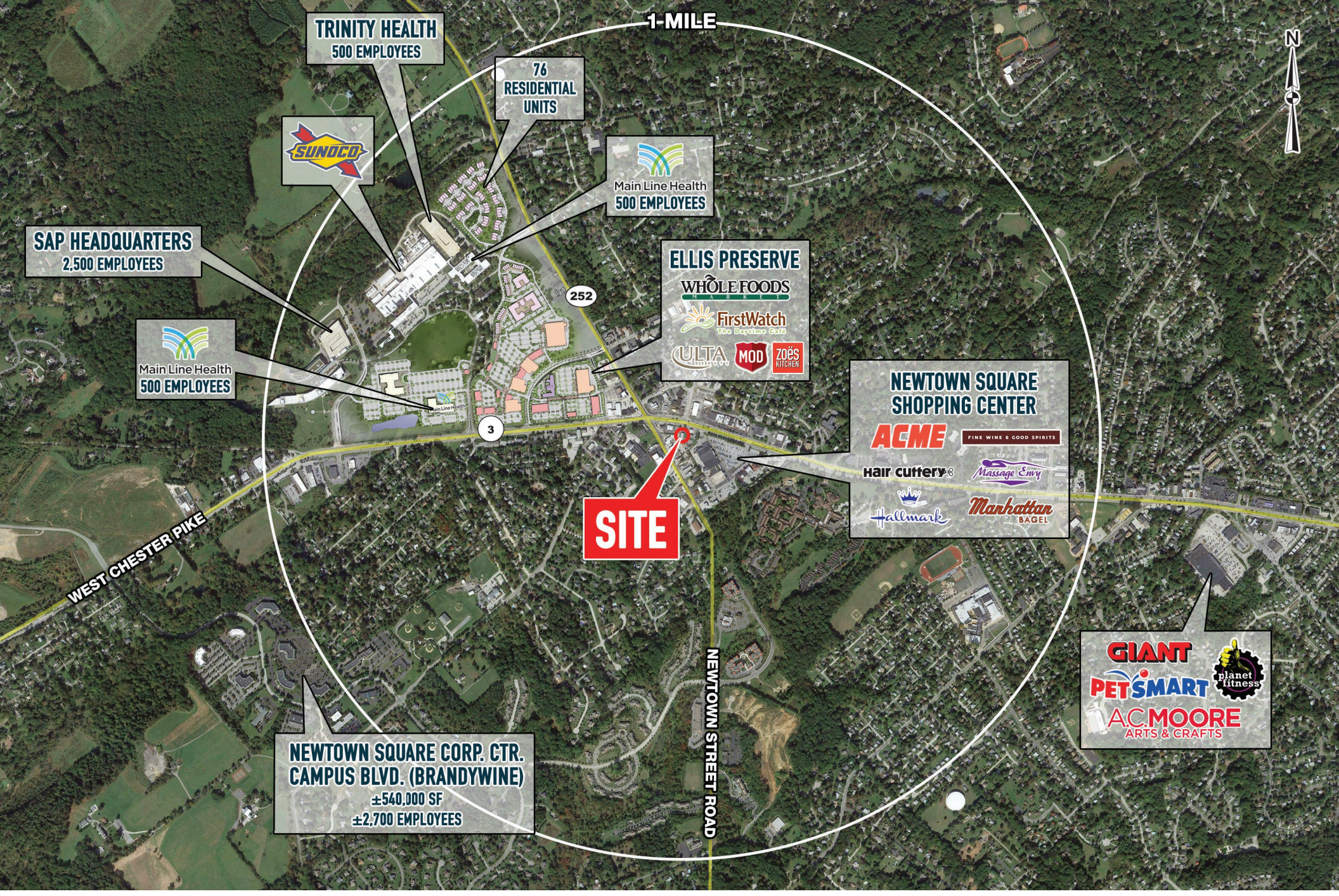
The information and images contained herein are from sources deemed reliable. However, Metro Commercial Real Estate, Inc. makes no representation whatsoever as to their accuracy or authenticity. Images shown may be modified for illustrative purposes. Images may be out-of-date and not current. 11.10.1