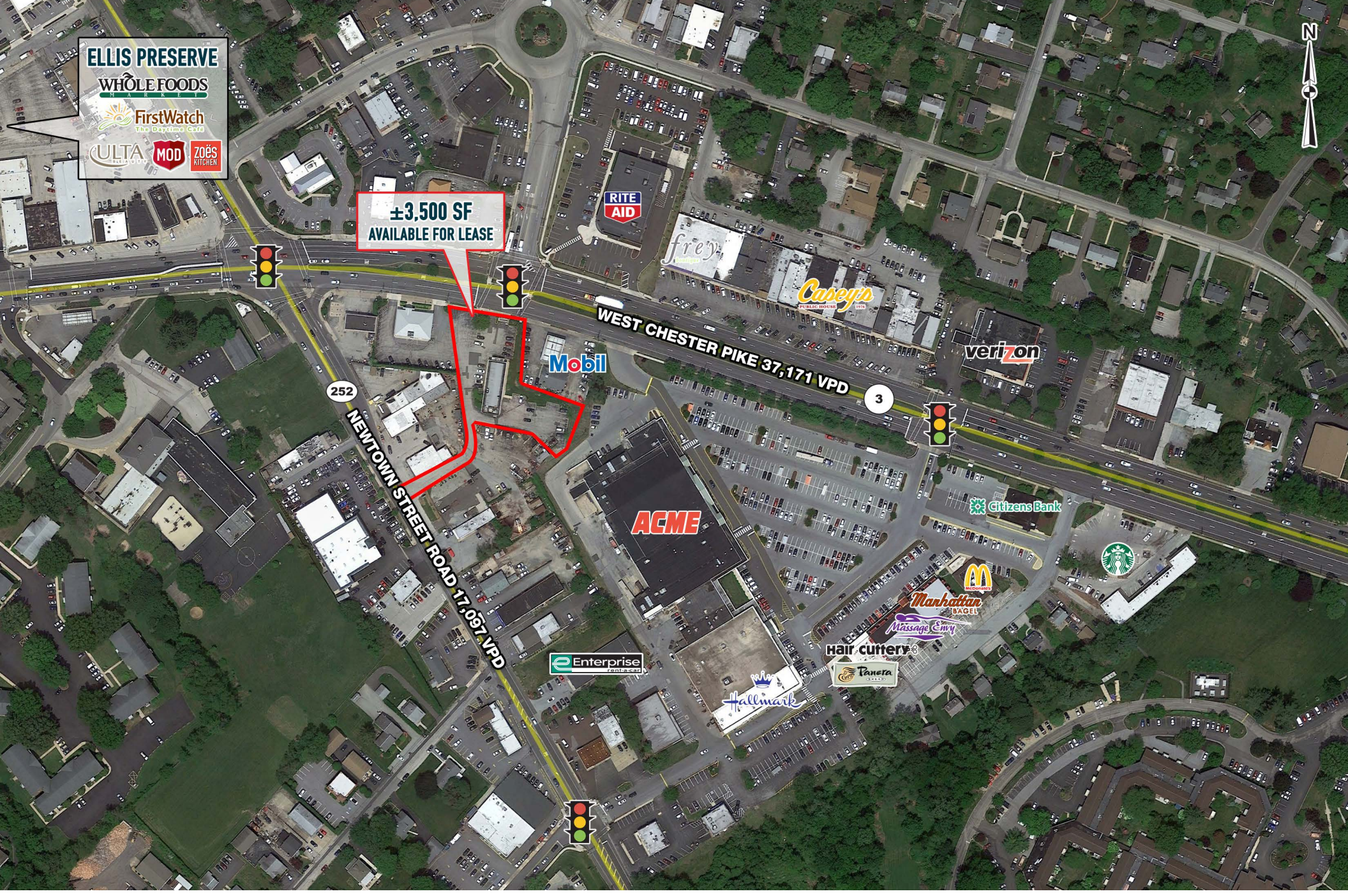
The information and images contained herein are from sources deemed reliable. However, Metro Commercial Real Estate, Inc. makes no representation whatsoever as to their accuracy or authenticity. Images shown may be modified for illustrative purposes. Images may be out-of-date and not current. 11.11